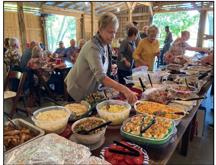
At the Riverview Farm Picnic, we always have plenty of delicious side dishes to share