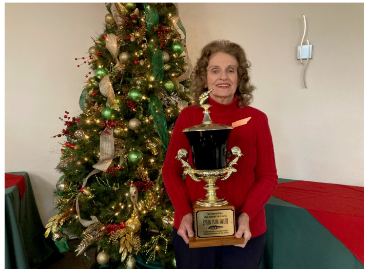
ETR's Sparkplug Winner for 2024