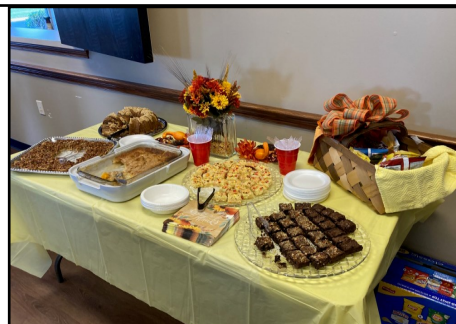
Below—Plenty of deserts provided by members