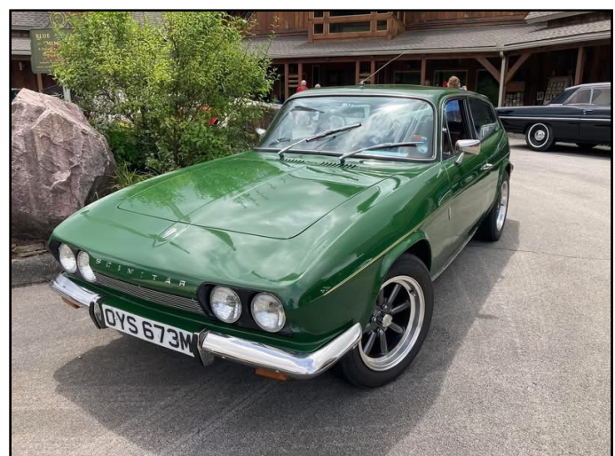
British Built Reliant Scimitar at the Autos Through the Ages Show in Townsend