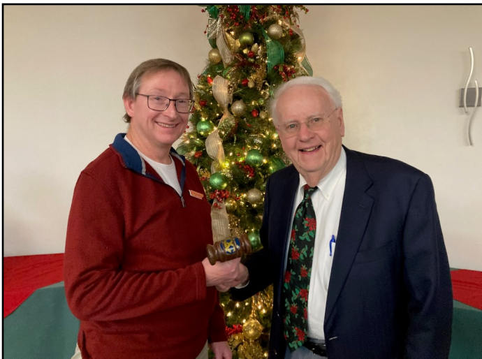
The Passing of the President's Gavel