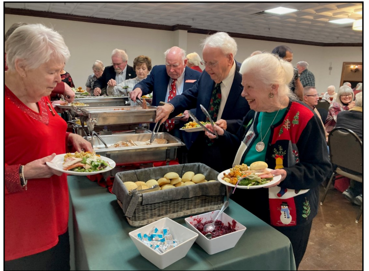
Enjoying the Buffet