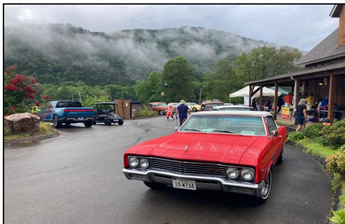
One of the feature cars at the Smoky Mountain Heritage Center was Jerry Hodge’s 1965 Buick Skylark GS Convertible

One of the most important events on the Club’s calendar is the “Autos Through the Ages” show held in July at the Smoky Mountain Heritage Center. While the day started out with clouds and rain, the sun came out and we had a beautiful day. Over 55 Club members volunteered in various areas as we hosted over 100 attendees along with 77 cars. The cars on display ranged from Matt Faust’s Brass-era Hudson Touring to current vehicles which included an Electric Rivian Pickup. Also on display was a beautiful 1958 Chevrolet Impala Sport Coupe and a Replica 1934 Mercedes 500K.