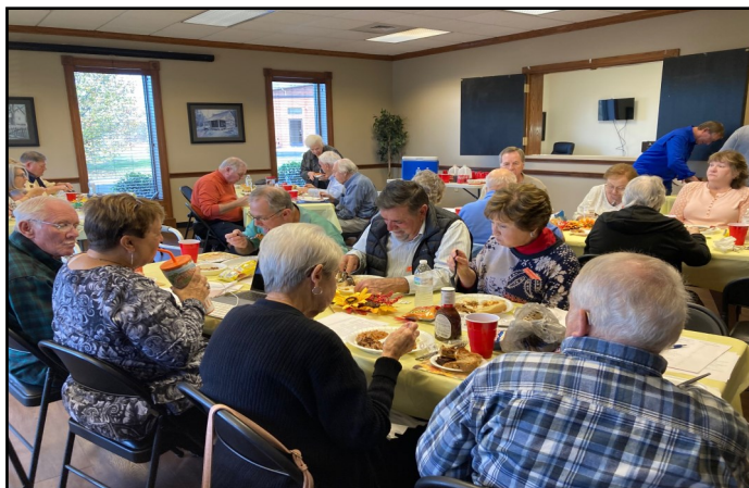
Above—ETR members enjoying lunch