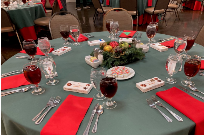
Rothchild's Catering always does a beautiful job with the table settings